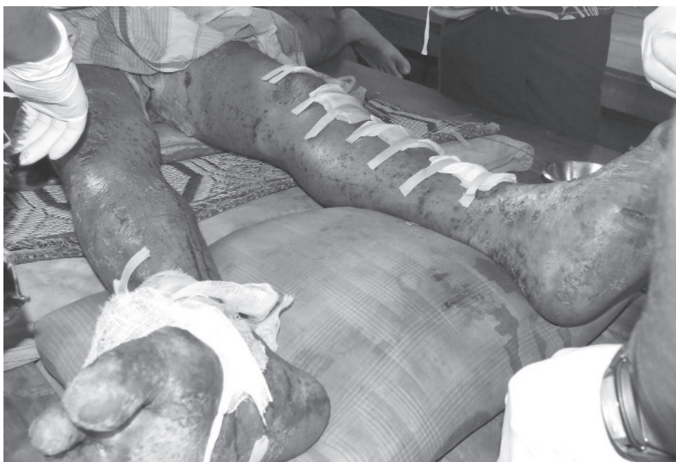
A porter tortured by the government troops in Karen State

which generally takes place in isolated rural areas, especially those in conflict areas, “where the military continues to routinely force civilians into carrying supplies or providing labor for a range of military related duties.” 38 The Burma army has also used prison convicts as porters in armed conflict zones, a practice that has been documented by Human Rights Watch, the Karen Human Rights Group, the United Nations, the International Committee of the Red Cross (ICRC), and Amnesty International. 39 In addition, threats, harassment and violence are often employed by authorities that forcibly recruit laborers, often leading to the use of torture and ill treatment to punish those who are disobedient or too weak to fulfill their duties.