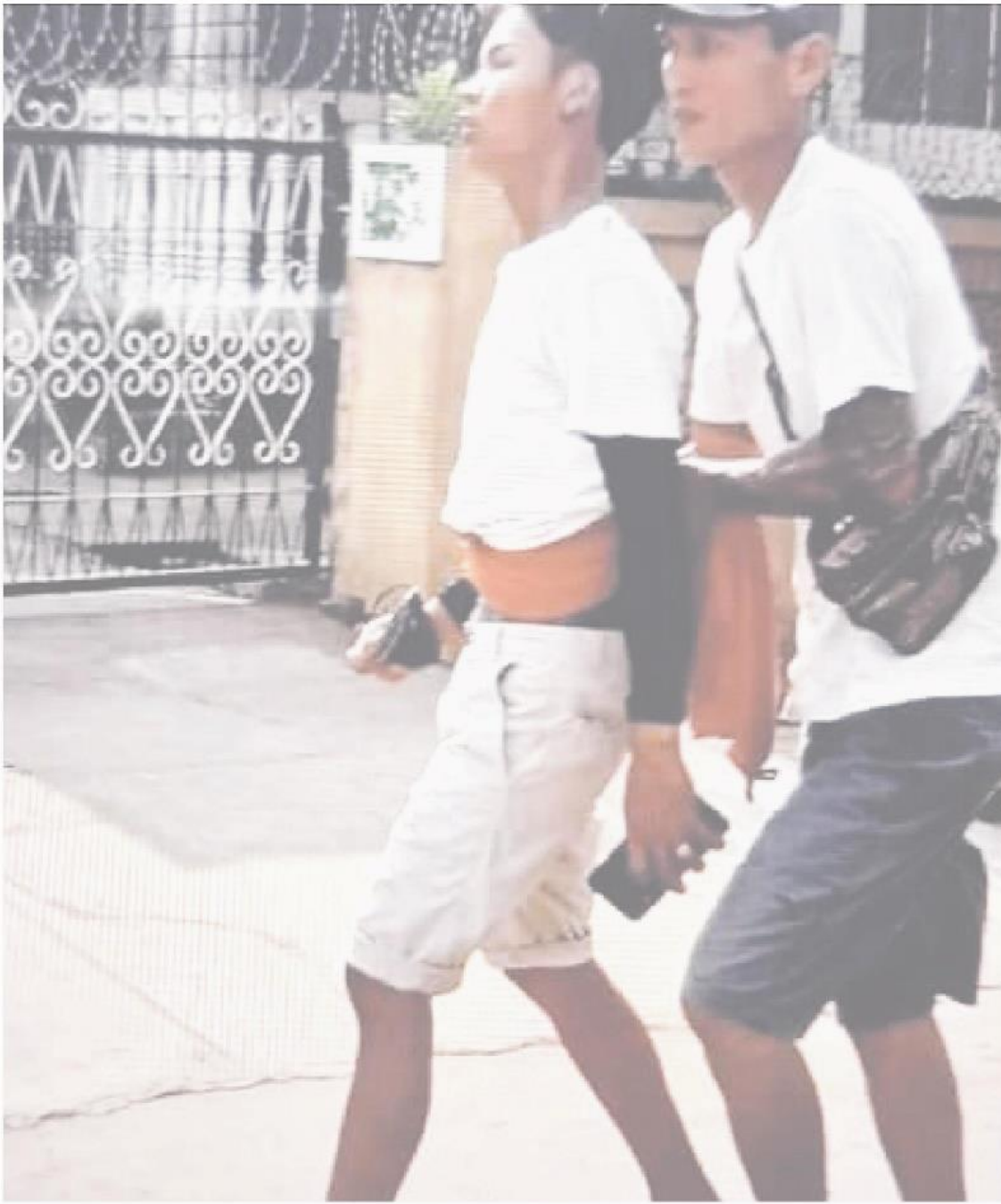
Photo: One civilian was shot dead at Kyaik Hto by army soldiers and another two were seriously injured. The body was taken by the Army troops and three were arrested, according to a witness report. 27 March 2021