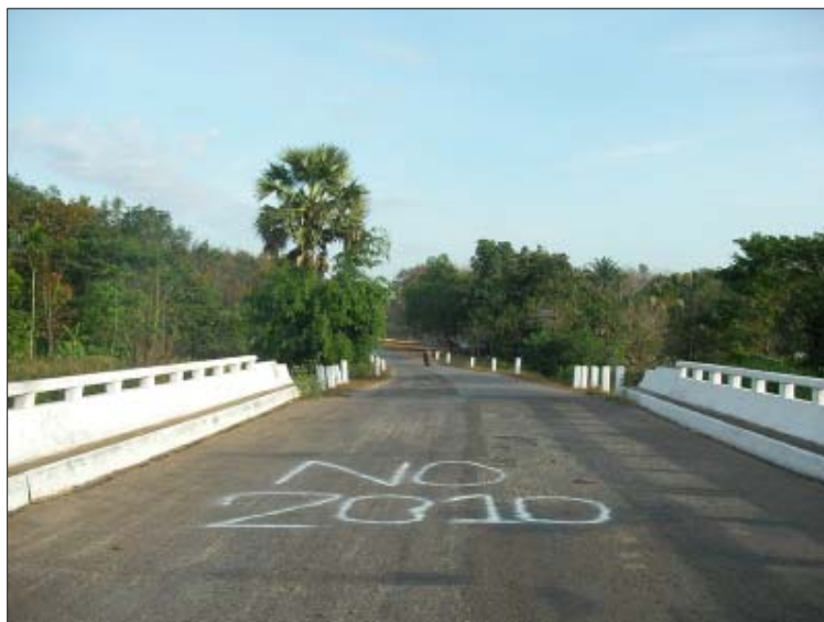
The words "No 2010" seen on the Moulmein to Tavoy motor road at the beginning of January, 2010.

for the military. This is the government's strategy for the coming election. We have to try to educate the residents. And monitor what kind of human rights abuses will be caused by the coming election. We need to express to the international community that it needs to know that the government is abusing human rights in their election process. It's necessary that the international community know that the election will not be fair and free.