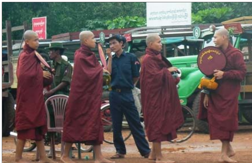
Buddhist Monks collecting alms are closely monitored by police, at the beginning of January in Mudon, Mon State.

While traditionally seen as the religious and moral compass of the nation, the monastic population of Burma has come under increasing scrutiny and outright pressure from the SPDC. The nation's monk community carries significant respect from civilian groups, is wide spread, well organized, and fosters a high degree of education, and is for these reasons seen as a threat to the continued domination of the junta in Burmese politics.