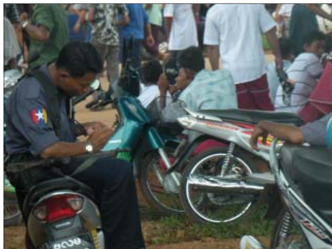
A Mon State policeman is on duty at a public ceremony, in Mudon Township, Mon State.

According to HURFOM's field reporter, in the beginning of January 2010 the military government in Naypyidaw ordered Brigadier General That Naing Win, chairman of the South East Command (SEC), to ensure that all Light Infantry Battalions (LIB) and Infantry Battalions (IB) in Mon State be ready to maintain security in preparation for the 2010 election. Among the security measures demanded by the Burmese government was the implementation of rigorous checkpoints, and increased travel restrictions on travelers moving around rural areas, or between rural area and urban sites.