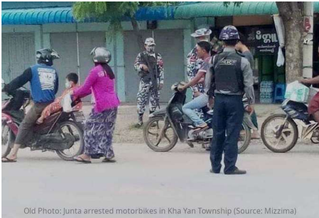
Old Photo: Junta arrested motorbikes in Kha Yan Township