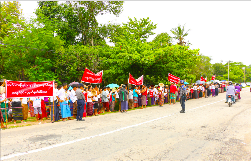
June 6, 2016

On June 5th, 2016, World Environment Day, 500 people from Ouktada village, Paung Township, Mon State, took to the streets to protest against gravel production by Long Life Aggregate Mining Company Limited.