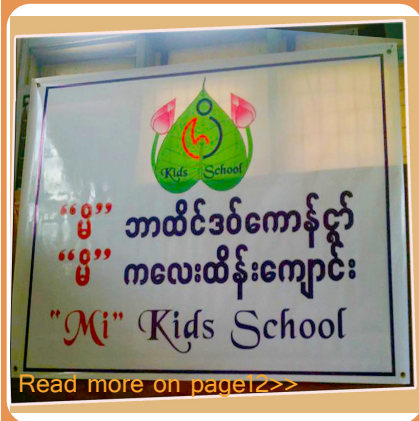
Read more on page12>>