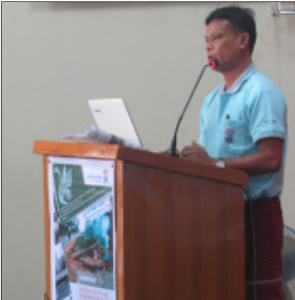
December 10, 2015

On December 10, 2015, the Human Rights Foundation of Monland (HURFOM) and its associate organizations celebrated International Human Rights Day and the 20 th Anniversary of HURFOM in Pine Khit Hall – Shin Saw Pu Street, Myine Thar Yar Ward, Moulmein, Mon State.