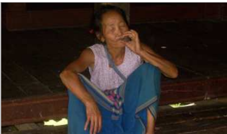
A local woman whose house was shot multiple times by Burmese troops.

That time also we [had to] collect money from each household in our village and pay as they demanded. It is also possible that the Burmese army overcharged villagers from other villages for money, but we do not know about that because we have not been informed. Yet, if we had known about that [other villagers were demanded to pay], we could not help them give money. This is because we have to struggle for our daily meals while the situation in the region is unstable.