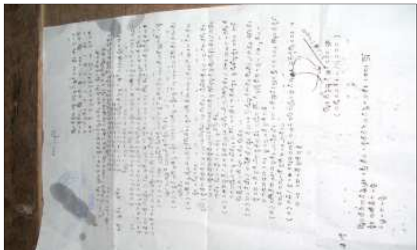
Alist of rules and restrictions during the Buddhist Water Festival.

On the 6th of April 2010, written orders stamped with Kyaik Don Sub-township Office seals were sent to the village headmen demanding a collection of funds, designated “the welfare fund.” Township authorities stated the Buddhist water festival as the reason for collecting such funds. This fund collection came about during a period of unemployment and a hike in commodity and gasoline prices. Many households had to borrow money in order to fulfill the fund donation request. Some vehicle owners, who were in a particularly difficult situation after having to pay increased gas prices, requested the ability to pay as much as they could, but were