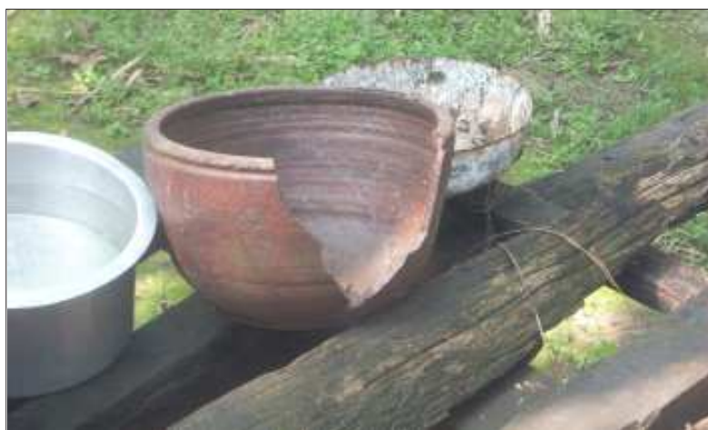
A washing basin is purposefully destroyed by Burmese troops during conflict with a Karen armed group.

Everyone knows that apart from ordinary villagers, my husband did not befriend anyone [any ethnic armed group]. He did not even have contact with any armed groups. So, why did the Burmese troops kill him? That's not fair. They are the ones who went into the battle but now the person who got killed is my husband. They are the persons who should get killed: not my husband. Now, I have my three kids and have no skills to work. Now, I do not know what to do as I can not afford sending my three kids to school and there is no rice left at home to cook.