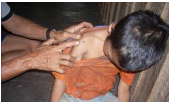
A wound inflicted on an 8-year old boy by Burmese troops during conflict against a Karen armed group.

Destruction of villager’s properties is part of the Burmese government’s Four Cuts Policy. According to the Network for Human Rights Documentation – Burma, this policy was originally instated in the 1970s. The purpose of the Four Cuts policy is to cut off rebel groups access to food, funds, information, and recruitment 10 . Effectively, this policy not only negatively affects rebel groups, but the locals who live in those areas as well.