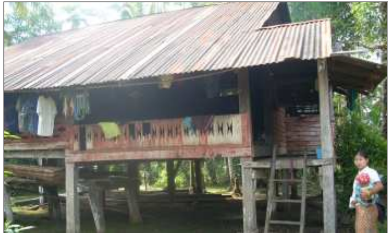
A local’s home is destroyed by Burmese troops from LIB Nos. 562 and 563 during conflict with a Karen armed group.

knew anything about the fighting. When we were on our way to Dauk Phalan village, suddenly a group of Burmese troops surrounded and tried to arrest us. As it happened immediately, I tried to escape, but because they surrounded me, I could not run away and I was arrested. I was very frightened when I looked at their faces. But, it was hard to interact with them using my legs and hands [trying to sign using body language]. Then, they made me kneel down on the ground, and three soldiers kicked my back and head with their soldier’s boots several times. Having kicked me for five minutes, their leader said to stop [kicking me], and at the time, I noticed my head had begun to bleed. In the beginning it was very