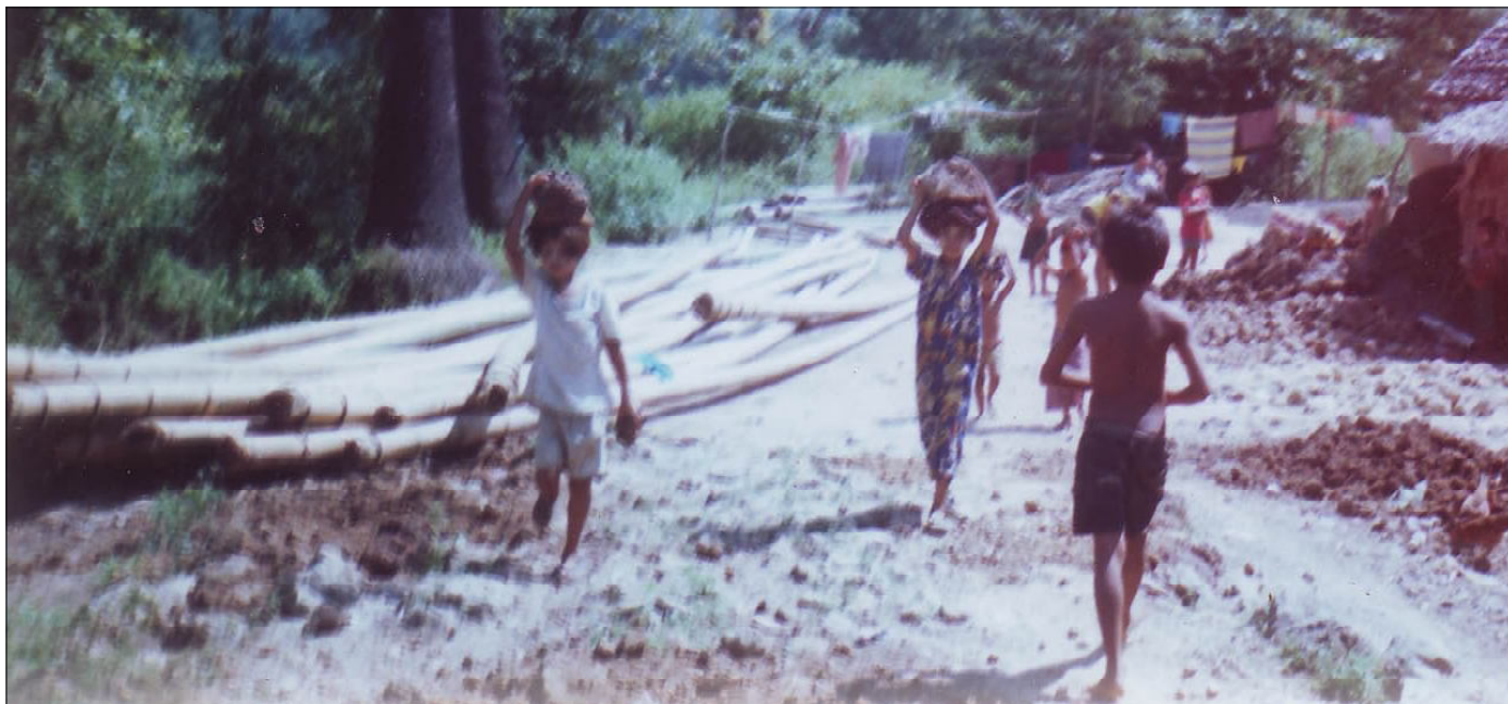
Young children carry heavy stones under the control of the SPDC.

According to the WCRP's finding, eight boys aged between 14 and 17 from — Village, Khawzar sub-township were forced to work at the police station. The boys started work before 7am until 6pm digging ditches, making fences, and cutting wood and bamboo, working for 36 days straight. All the boys were attending school and missed school when they were working. They had to provide their own food, water, and tools.