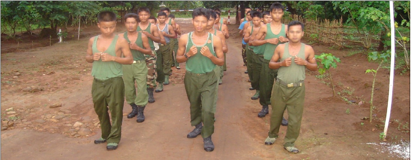
SPDC's Light Infantry Battalion (LIB) No. 588 provides military training to children