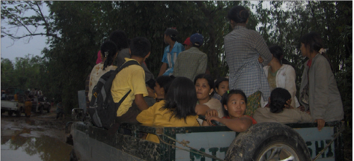
Southern Burma residents in the process of fleeing their homes